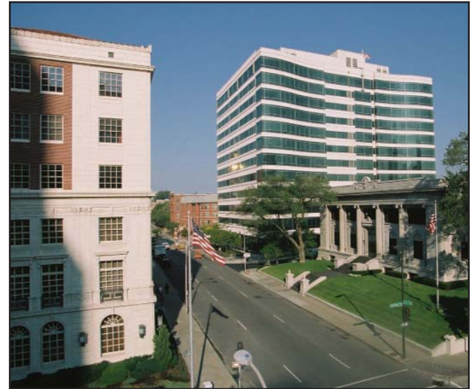
Americo's Corporate Headquarters is centrally located in downtown Kansas City, MO.

***Information is as of end of year 2006 on a consolidated basis for Americo Financial Life and Annuity Insurance Company and the other life insurance subsidiaries of Americo Life, Inc., unless otherwise indicated. Information is prepared on the basis of Generally Accepted Accounting Principles (GAAP).